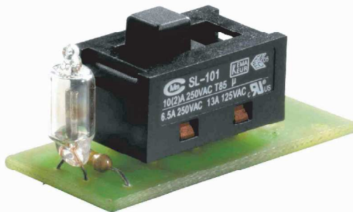
• PCB design and assembly